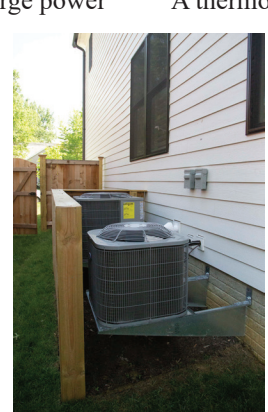
Knowing how to spot a faulty heat pump can save you considerable money while heating this winter.

Albemarle EMC is committed to helping our members use electricity as efficiently as possible. Though we currently cannot offer in-home energy audits, we will do our best to help you over the phone. To speak with one of our customer service representatives, simply call (252) 426-5735. We advocate low-cost methods to save energy for the simple reason that high-cost methods rarely are cost effective over a reasonable amount of time. One of the most valuable things we give members is the knowledge of where their energy dollars are going. Armed with this information, members can then decide which trade-offs they are willing to make to keep their power bills manageable.