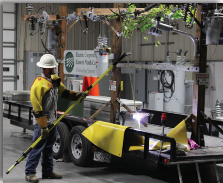
Lineman Apprentice Drake Trueblood