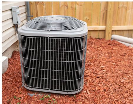
A heat pump is the single biggest user of electricity in most homes.

the heat pump automatically reverts to a backup heat system, called auxiliary or emergency heat. The backup heat is a series of metal strips that heat up much like a toaster oven. An air handler blows air through the heat strips. The heated air comes out of the registers at about 120 degrees. The backup system heats a house wonderfully. The problem is that it is very expensive heat. So if your heat pump ceases operating outside,