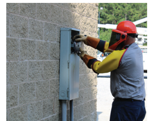
Protective clothing and a face shield are some of the many ways an arc flash injury can be prevented.