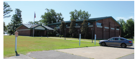
The 2023 Annual Meeting will be held at the Perquimans County Recreation Department, located at 310 Granby St., Hertford.

Following the election of directors, drawings will be held for cash prizes. Members only need to attend the in-person meeting for the most senior-man and senior-woman-in-attendance prizes. Members do not need to attend the in-person meeting inside the building to be eligible for the prize drawings.