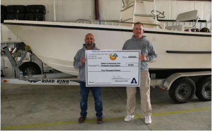
The Bethel Community Fire Protection Association was recently awarded a $5,000 Albemarle Community Trust grant to purchase a "BETHEL FIRE DEPT." wrap for their fire-rescue vessel.