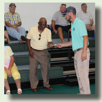
A member receives a prize, after their name was drawn.