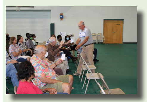
A member casts their vote after viewing videos of candidates' speeches.