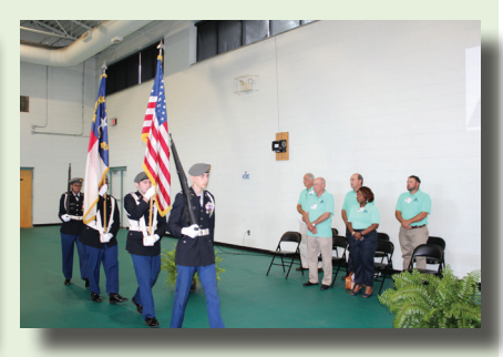
The John A. Holmes High School Junior ROTC renders colors for the Pledge of Allegiance and the National Anthem.